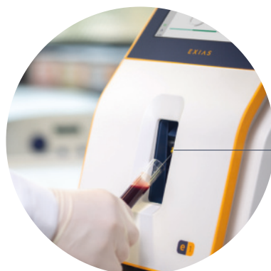
Sample tube mode